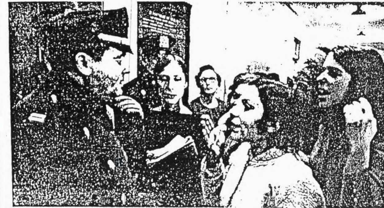
NO ENTRY: A police captain blocking a group of vocal women demonstrators trying to enter a closed session of a legislative committee hearing on abortion reform. Earlier, the women had disrupted a public hearing of the committee.

"We've waited and waited while you have held one hearing